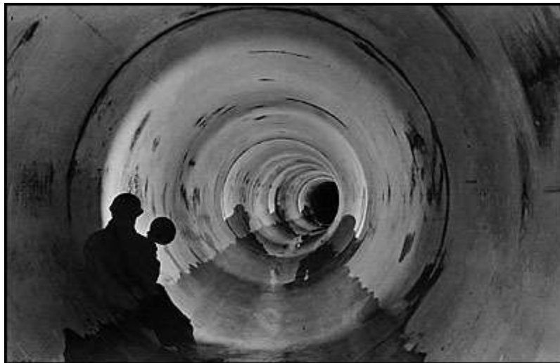
Existing Coxwell Trunk Sewer – Circa 1960

In the late 1950s, to facilitate the expansion of the city of Toronto a 2.6 m ID trunk sewer was installed connecting northern sections of the city to the treatment works by the lake. At that time, this was tricky undertaking with excavation by hand through water-bearing alluvial materials. Tunnel depths were up to 45m and compressed air was utilised as support.