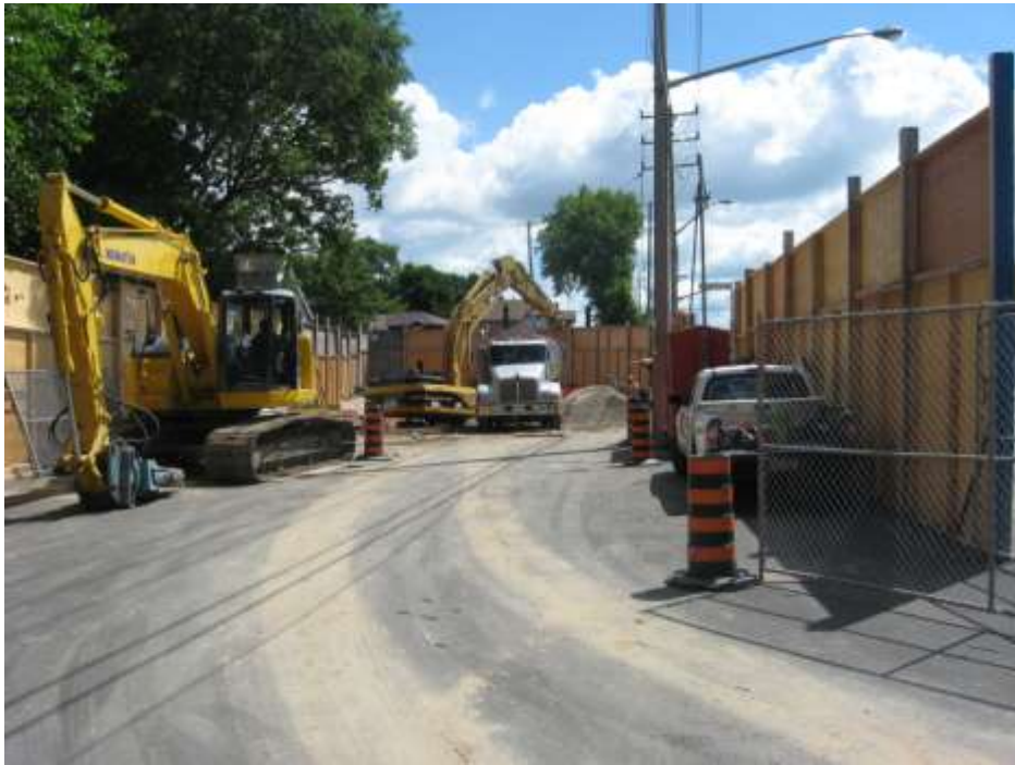
Figure 1. General site at the Exit Shaft location.