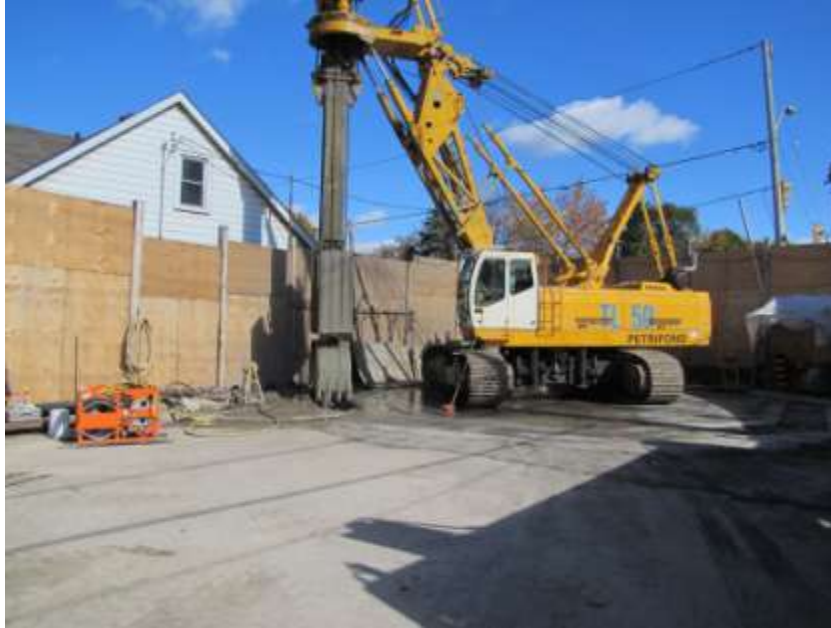
Figure 3. Slurry Wall rig used to excavate the panels.

The choice of equipment stemmed from the project challenges mentioned. In addition, panel alignment and verticality are the most essential elements for a successful result in a circular shaft. As such, to excavate panels to a depth of 47 M, Petrifond decided to utilize a hydraulic pile rig equipped with specialized hydraulic clamshell buckets. The KRC Casagrande hydraulic clamshell bucket is fixed to a rigid Kelly bar enhancing vertical excavation tolerance through the dense soils. In addition the clamshell piston offers a closing force of 200-Ton, which was required to overcome the very dense till matrix. Figure 3 shows excavation rig slurry wall equipment excavating at the Shaft.