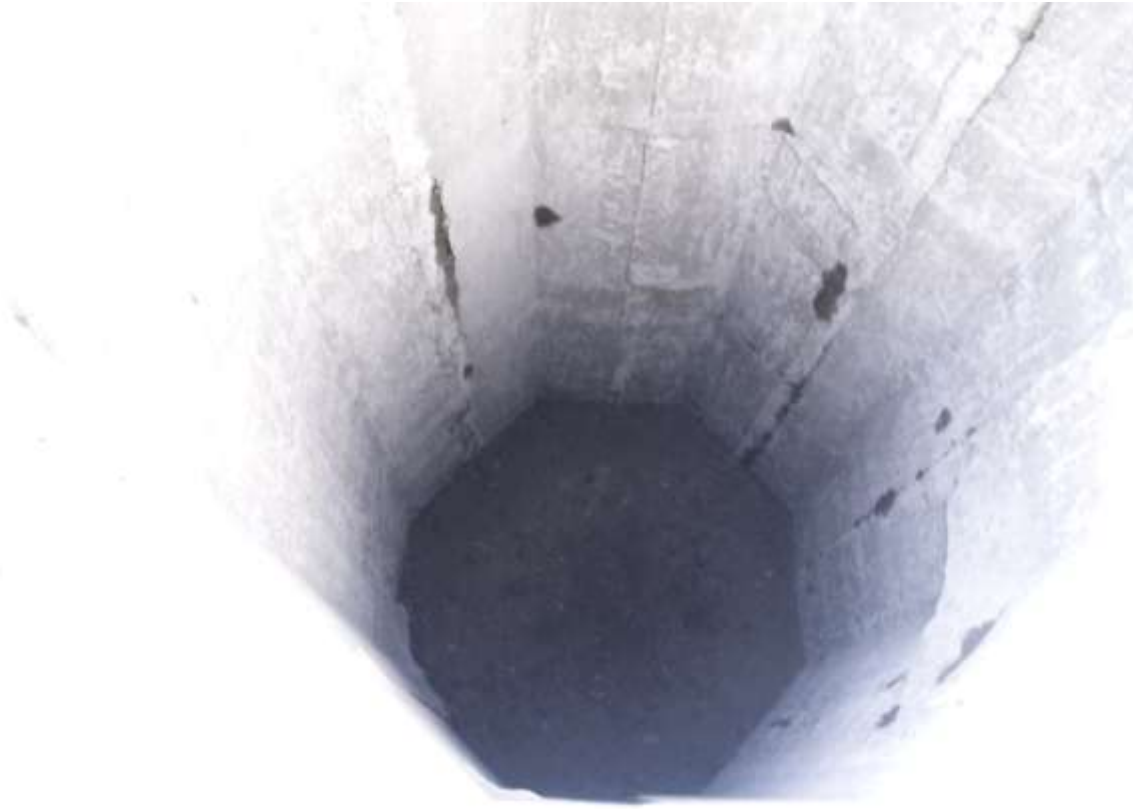
Figure 4. Slurry wall shaft exposed to 100-ft depth.

Because of the extremely limited site space, reinforcing cages were prefabricated and stored at a compound located at the Entry Shaft. The rebar cages were then delivered as required to suit the concreting operations. Concrete ready mix trucks were stationed at a nearby parking lot and on queue for delivery to the panel. No more than two trucks at any time were on the site due to the area constraints.