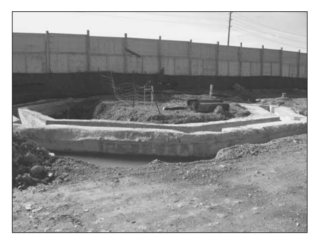
Figure 2. Guide walls at Access Shaft No. 3