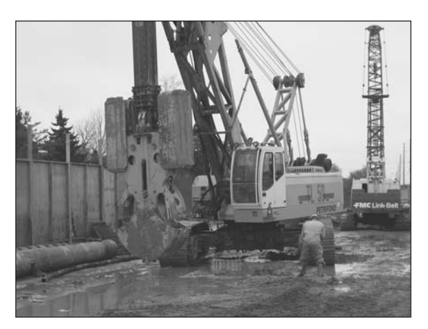
Figure 1. Slurry wall rig equipped with hydraulic clamshell